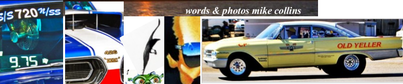
words & photos mike collins

The Xtreme crops are all a tease; not this 2010 Ol' Yeller shot, but it's seen with full size images of smokin' an' wheelstandin' action when Hot Gossip kicks off on the start line at CHRR 2019, an obvious Super Stock 426 hemi messing my mind by crashing the A/FX Q session; thankfully my lil' green pal and screamin' eagle come to the rescue, honest! After some 2010/ '12 racing to cool me down, we've 2019 A/FX wheelies, two 9-second classics; one ol' school t'other wild paint, cool art - and a real 1950's rickshaw in action! My first stunning sight of